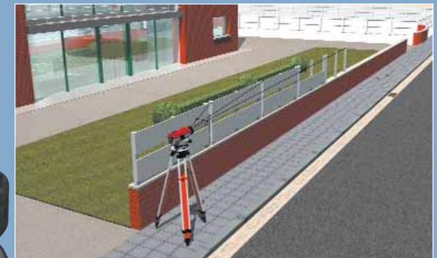
Level up with the Pentax AP-100 Series Levels